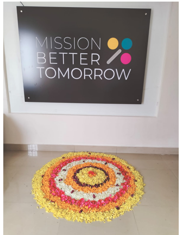
The first Onam celebration at Mission Better Tomorrow after forming the Secretariat.