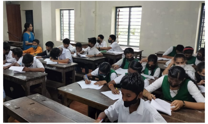
Children appearing for the screening test of CEEP

After addressing SPCs, ORC, Chiri volunteers and HOPE students, Mr. Vijayan inaugurated 'Akshayapatram', a project taken up by MBT-Nanma in Palakkad along with district police to distribute free packaged food for street dwellers.